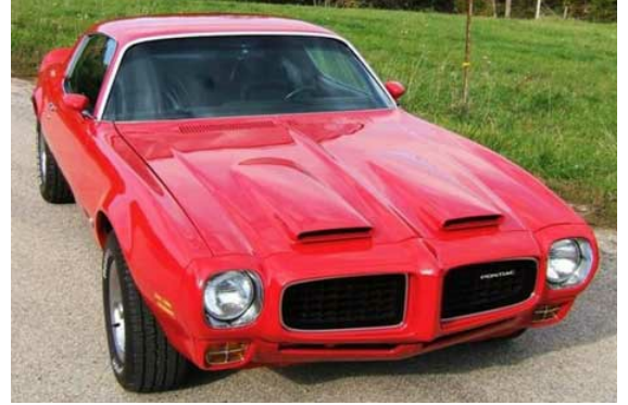
Image is general in nature and may not reflect the specific vehicle selected.

General Motors' sensational F-body restyle for 1970 fit the Trans Am to a T, and the same basic look — announced prominently up front by a rearward-facing “shaker” hood scoop — stuck around up through 1981, gaining additional fame thanks to appearances in Burt Reynolds' Smokey and the Bandit movies. Pontiac's big 455-cid V-8 was the sole power source from 1971 to 1973. Considered by many to be Detroit's last great muscle car of the '70s, the 455 Super Duty Trans Am was built for both 1973 and '74. Output for the emissions-legal 455 Super Duty V-8 was 290 horsepower.